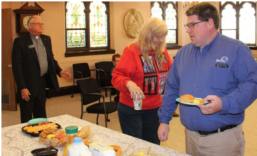
MAX Program Volunteer Appreciation Coffee